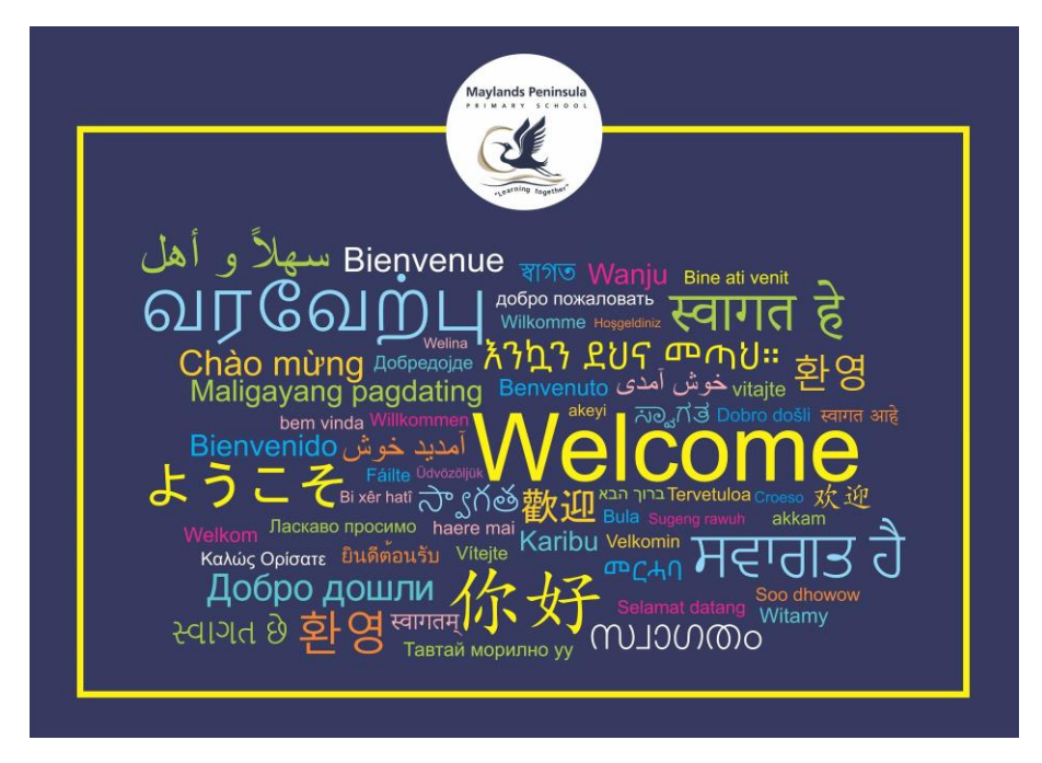
1 - Embracing Diversity