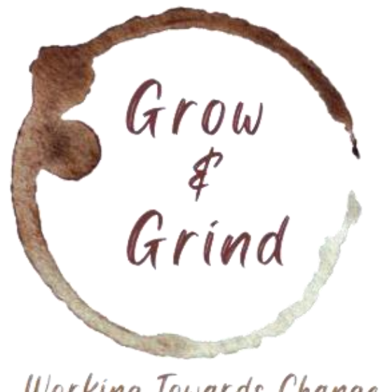
Working Towards Change