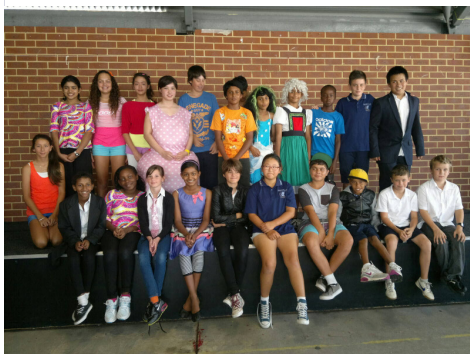
Year 7, SI Assembly Friday 15 February 2013